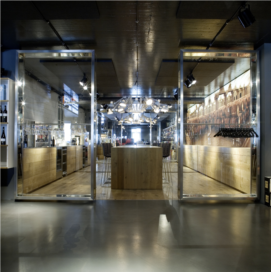
Casa del Vino Birrhard