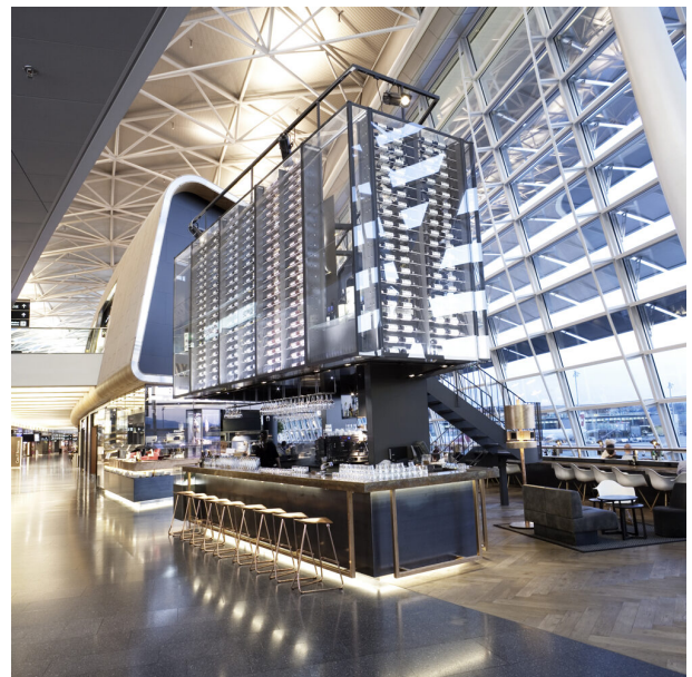
Design P.5 Zürich