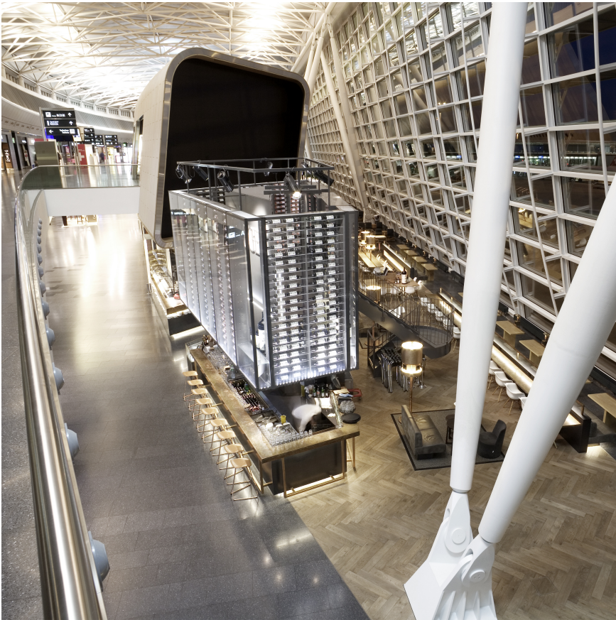
Villa Antinori da Bindella, Zürich-Flughafen