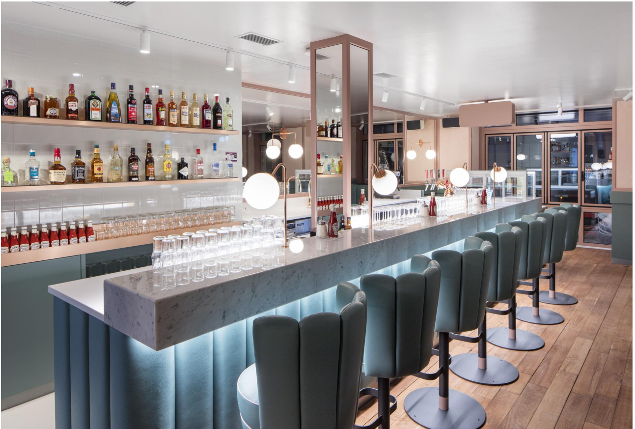
Helvti Diner, Bellevue Zürich