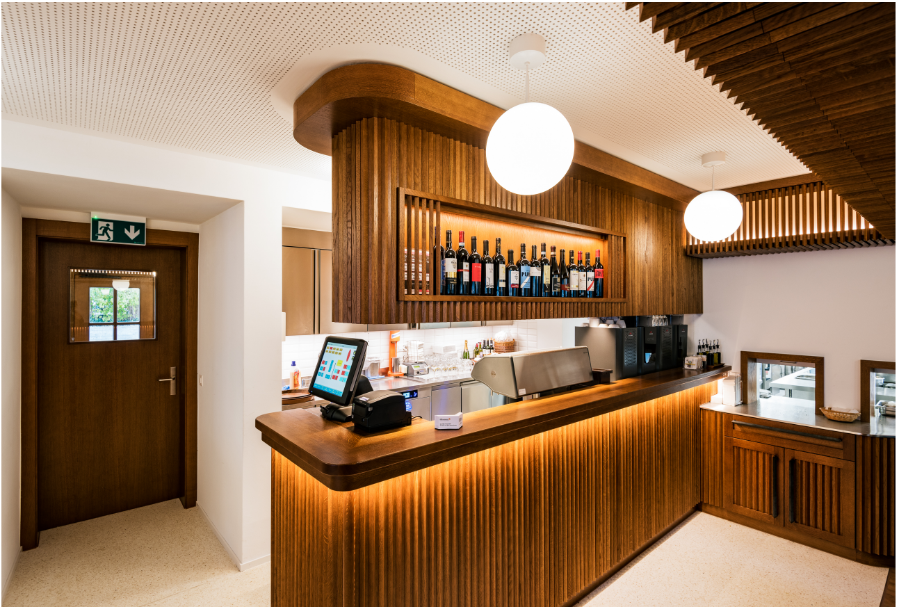
Restaurant Rössli zur Vogtei, Herrliberg